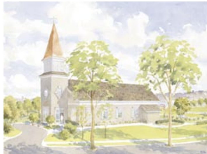
Artist's impression of the Breakfast Point Community Hall.

Within the next few weeks, the roofing and cladding, which has already commenced, will form the final exterior work. This will enable internal floorboards, stage and loft area to be assembled. Finally, elegant windows and exterior white timber paint-work will be added, ensuring