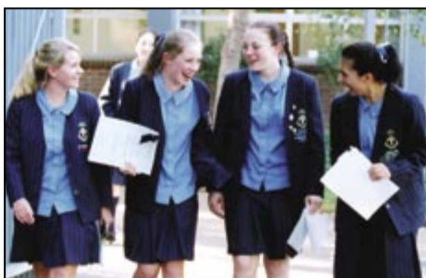
Students of MLC Burwood.