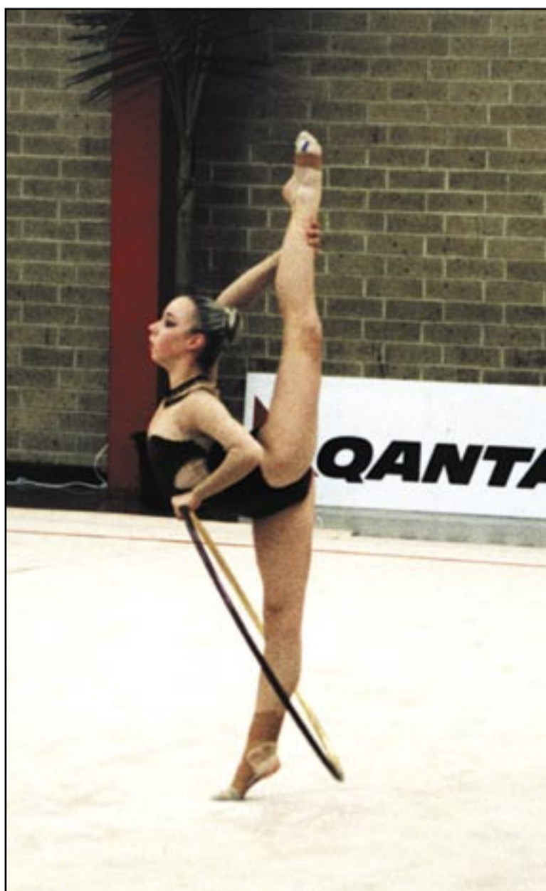
Concord High offers International level sports tuition.