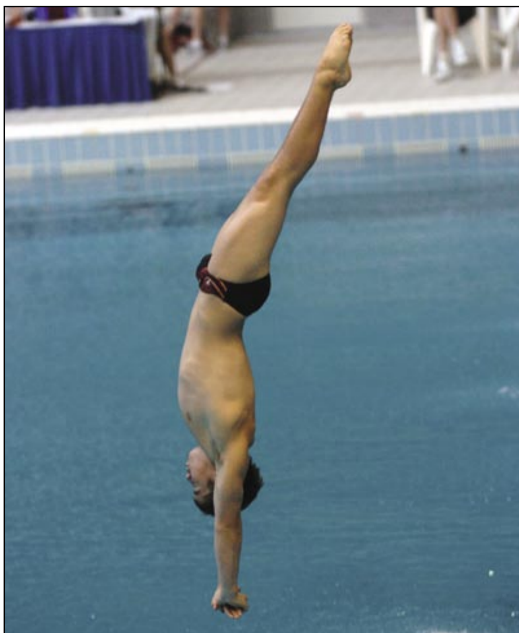
Concord High celebrates its elite divers in Beijing.