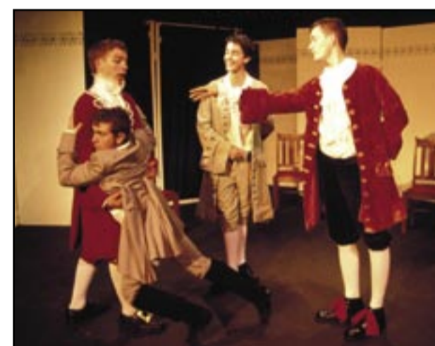
McDonalds College students often go on to study at an International level.