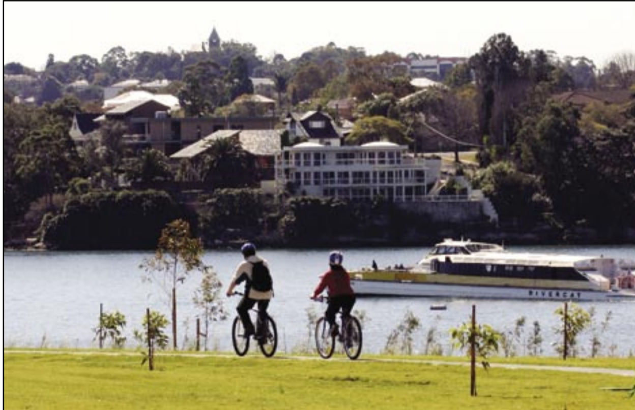
The Breakfast Point Waterfront Park offers a stunning view of the scenic upper harbour waters.

Breakfast Point is proud to announce the opening of several wonderful parks, walkways and roads.