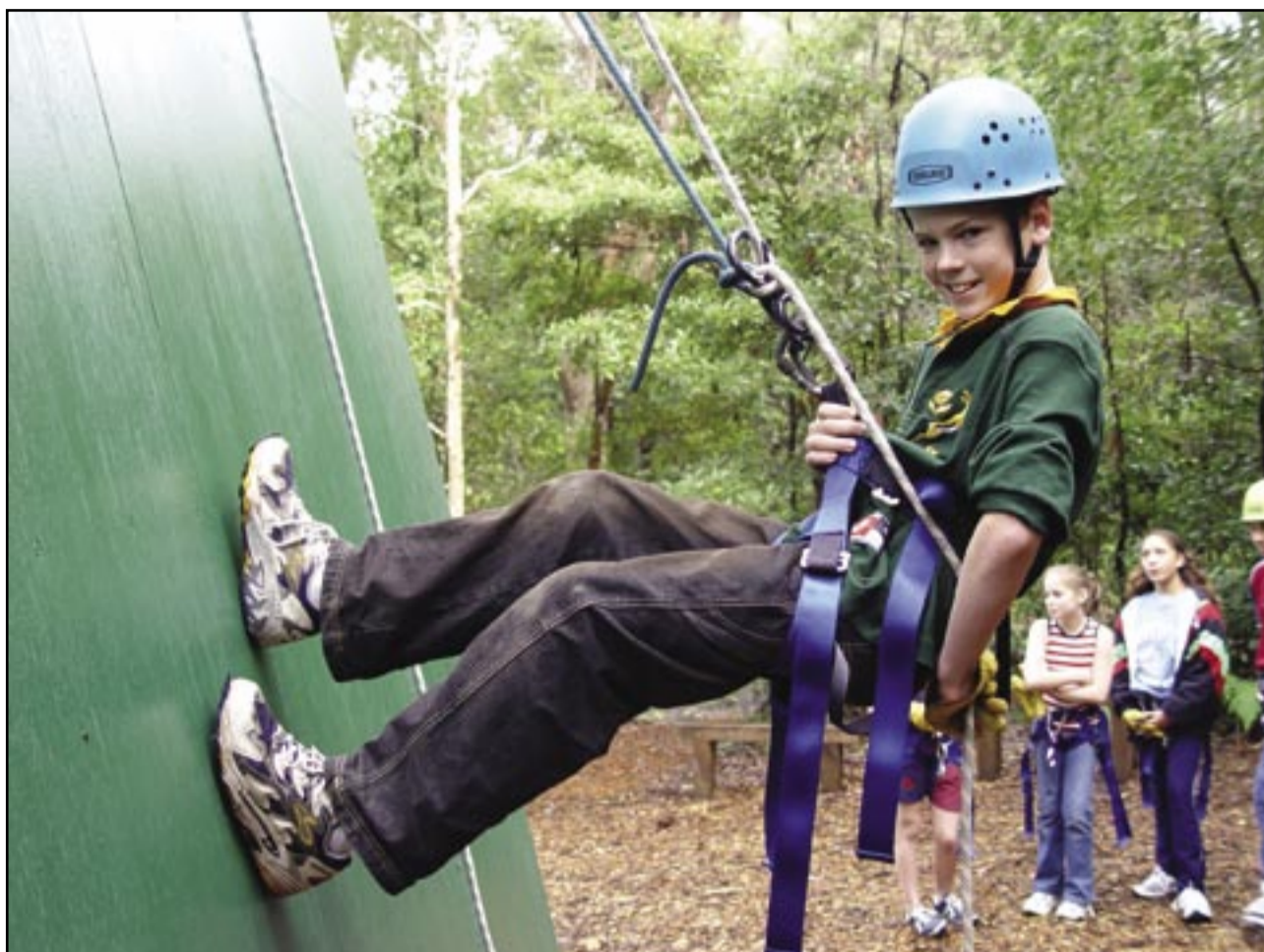
Time out for the students of McDonalds College is often spent hanging around!

The school also offers a variety of vocational and educational courses from hospitality to construction and engineering. "We are an all-round school but we get some brilliant results in the Higher School Certificate,"