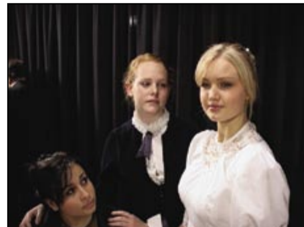
Students of McDonalds College perform in a Russian play.