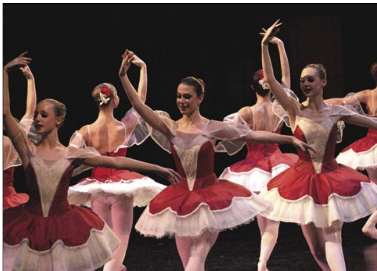
The choreoscope ballet of McDonalds College.

PLC Sydney is at Croydon and is a non-selective school of the Presbyterian Church and caters for girls from reception to Year 12. The school has 1300 students and boasts a "state-of-the-art" library, a music centre, computer laboratory, a world-class "sprung" floor gymnasium and multi-purpose hall, and a short-course outdoor swimming pool. A Performing Arts Centre and Indoor Aquatic Centre are under development. Among