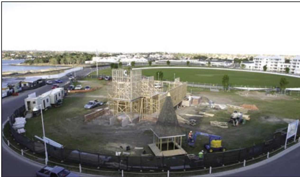
Image taken of the construction of the Breakfast Point Community Hall, early August, 2004.

With completion date scheduled for late November, residents of Breakfast Point will be delighted to know The Community Hall will be ready for Christmas festivities.