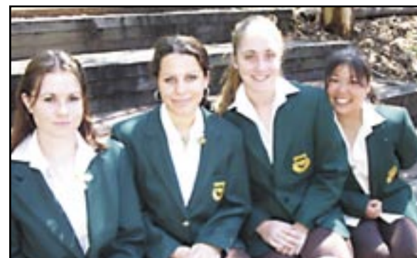
Female prefects of Concord High.

If it is education you are looking for in the Breakfast Point area you are spoilt for choice.