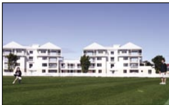
The Breakfast Point Village Green is the perfect place to unwind and relax after a busy day.

With so many wonderful places now open for residents and families of Breakfast Point to enjoy, it's no wonder that more and more people are choosing to call this wonderful waterside village, home.