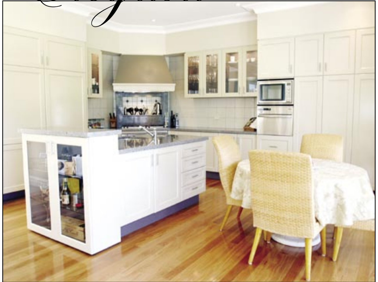
The first Breakfast Point waterfront homes will be completed in April 2005.

Island benches have also been introduced to the Breakfast Point waterfront homes; a stylish piece of architecture, carefully positioned to not only serve as a central point for dishwashing and serving, but also allowing the host a central point from which to prepare and serve food whilst still enjoying the company of guests, friends and family.