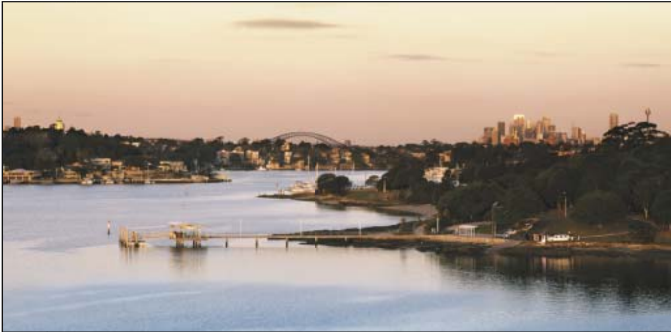
The magnificent views celebrated from Hunters Wharf.

It was a celebration for all last month as Breakfast Point released the long awaited waterfront apartments of Hunters Wharf. From the early morning of Friday, until late afternoon Sunday, excited visitors arrived at Breakfast Point to find out about the prestigious homes, named after the very person to have discovered and named Breakfast Point itself: Captain John Hunter.