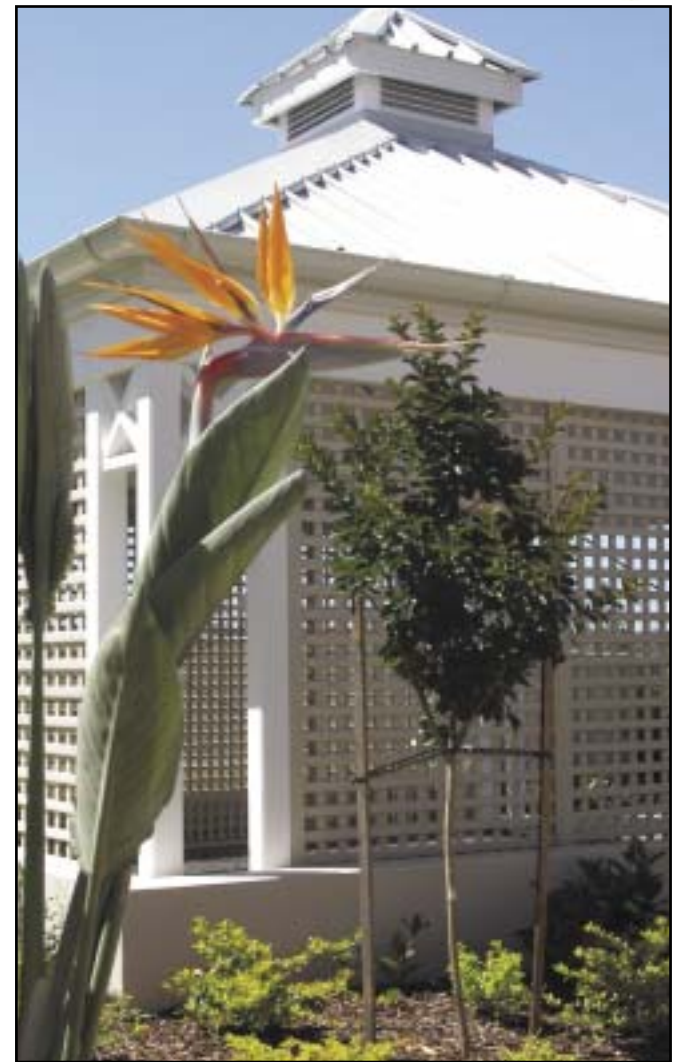
Water from the car wash bays will be treated and stored in the huge underground tanks.

Construction of the Country Club and Silkstone Park water tanks has already been completed, with the new village green already being watered from stored rainwater.