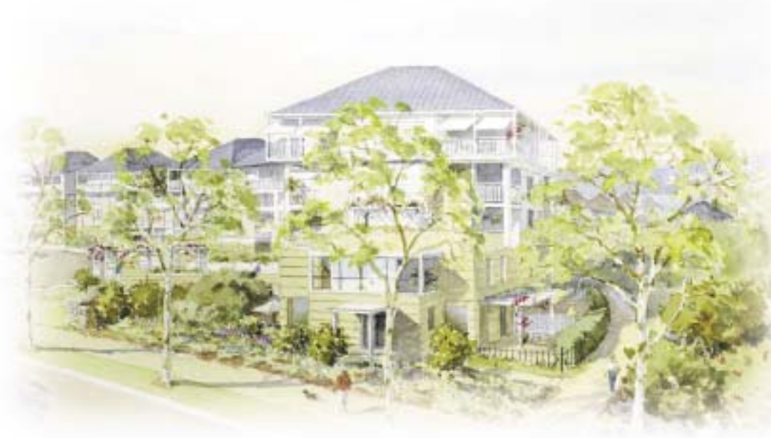
Garland Mews becomes ready for internal work to begin.

This must be one of the most anticipated areas of development right now! Construction will begin before Christmas with staged completion dates extending over the next 2 years. Work will commence near Admiralty working towards Hunter's Wharf.