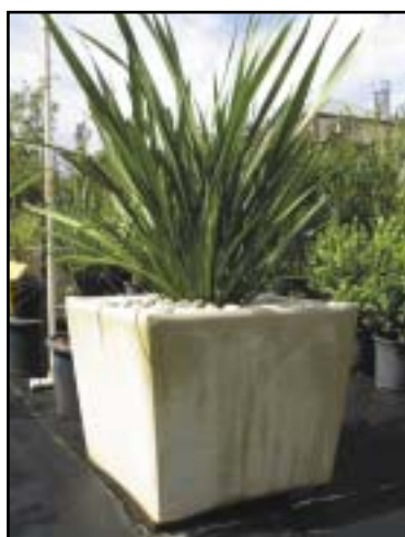
Potted Phormium Tenax

It is a myth that all native plants are drought resistant and that all exotic plants are thirsty