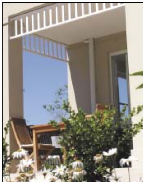
Garden apartments are one of the most popular designs of Breakfast Point.

With the recent launch of the stunning Hunters Wharf providing so much interest in the foreshore area, when can we expect to see the commencement of the Waterfont Park and Foreshore Walk?